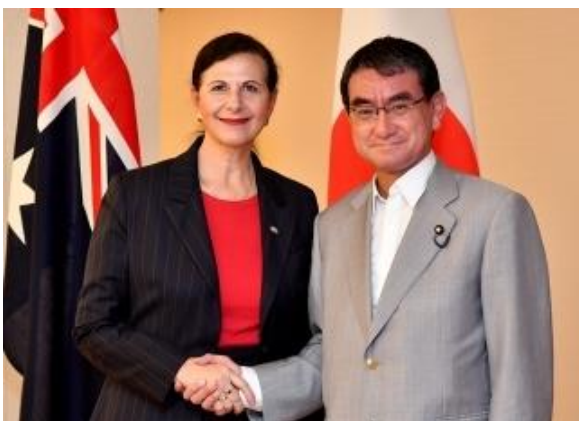
Minister for International Development and the Pacific Concetta Fierravanti-Wells and Minister for Foreign Affairs Taro Kono

Leaders from Australia, Cook Islands, Federated States of Micronesia, Republic of Fiji, French Polynesia, Republic of Kiribati, Republic of Marshall Islands, Republic of Nauru, New Caledonia, New Zealand, Republic of Niue, Republic of Palau, Papua New Guinea, Samoa, Solomon Islands, Tonga, Tuvalu and Vanuatu gathered in Iwaki, Fukushima, Japan on 18 and 19 May 2018 for the Eighth Pacific Islands Leaders Meeting (PALM 8) .