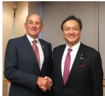
At the courtesy call in May

Both parties expressed their willingness to enhance cooperation in the lead up to the seventy-fifth anniversary of the "Cowra Break-out" next year.